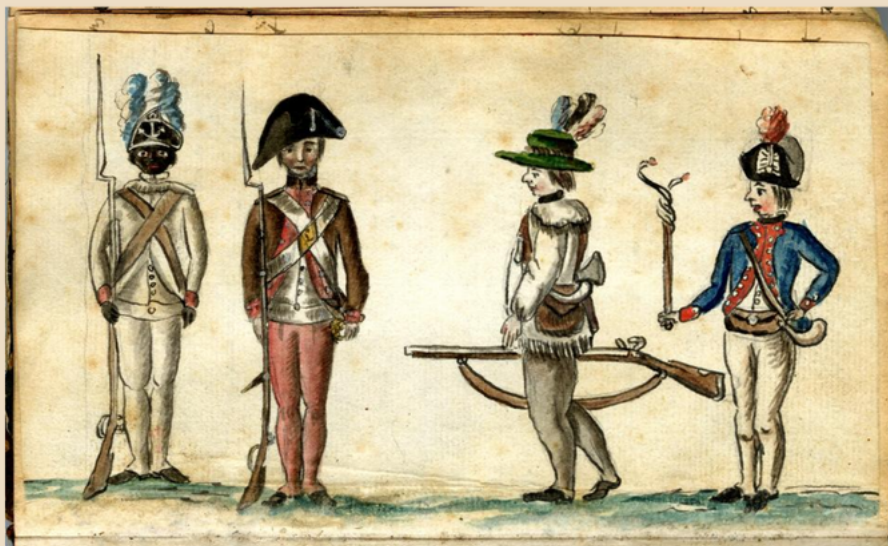
Library of Congress - Soldiers in Uniform World Digital Library